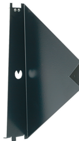
Simple aiming device