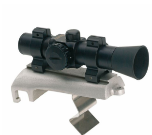
Zařízení pro přesné zaměření