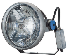
MVF403 - MASTER MHN-LA - 1000 W