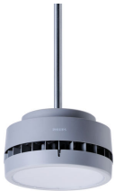
GreenUp Lowbay G2 BY288P