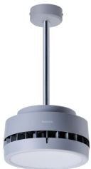
GreenUp Lowbay G2 BY288P Pipe