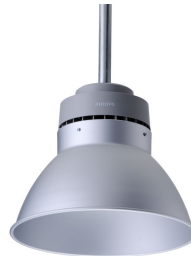
GreenUp Lowbay G2 BY288P w Reflector