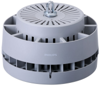
GreenUp Lowbay G2 BY288P Back